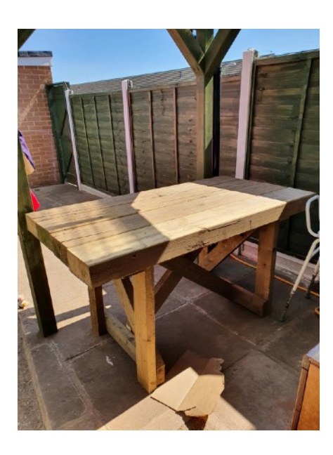
Jack, Ryan and their dad have been working hard in our garden and have painted the fence, made a bench and a table - all out of recycled wood.