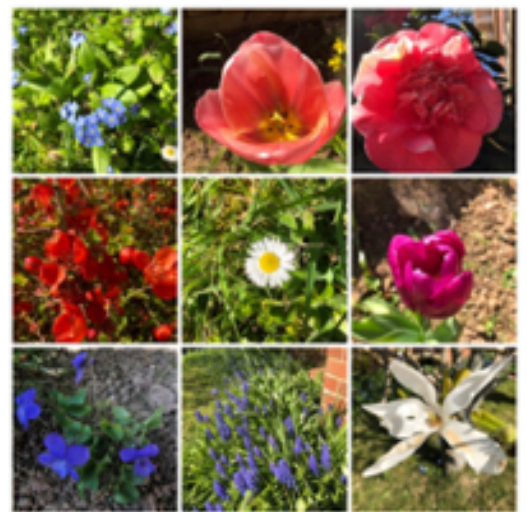
Chloe has been working on her photography skills, and took these beautiful pictures of flowers.