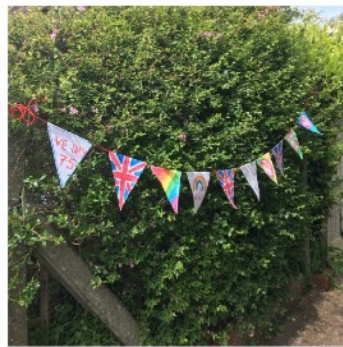
Wilf and Ralph made their own bunting to decorate their house ready for a socially distant tea with their neighbours to commemorate VE Day.