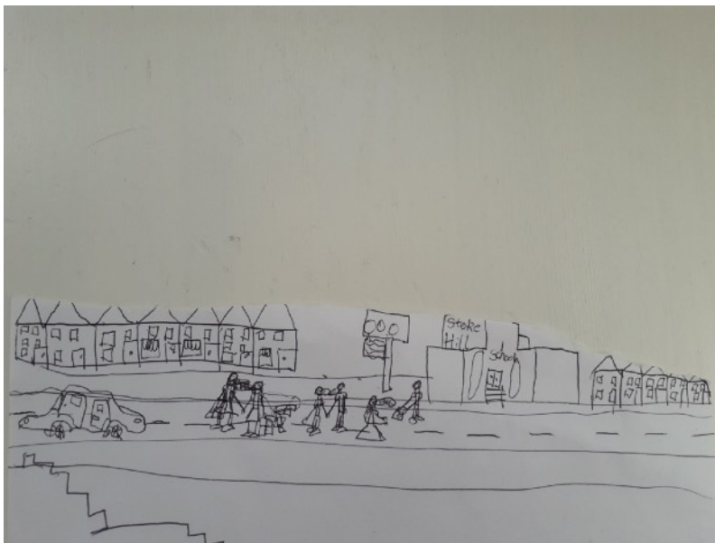
Jessica drew this very effective line drawing.