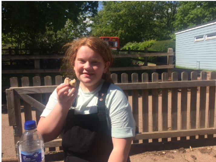
Some of our key worker children made bread in the pizza oven.